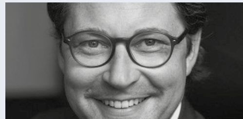
Andreas Scheuer Minister of Transport and Digital Infrastructure, Germany