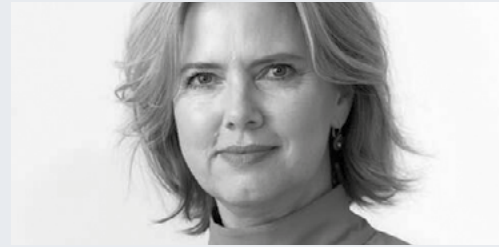
Cora van Nieuwenhuizen Minister of Infrastructure and Water Management, The Netherlands