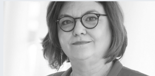
Adina Vălean European Commissioner for Transport