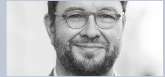
Timo Harakka Minister of Transport and Communications, Finland