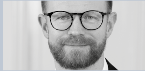
Benny Engelbrecht Minister of Transport, Denmark