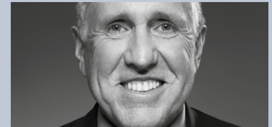
François Bausch Minister for Mobility and Public Works, Luxembourg