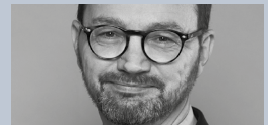
Tomas Eneroth Minister of Infrastructure, Sweden

SAF SAF GOVERNMENTAL STATEMENTS SAF SAF SAF