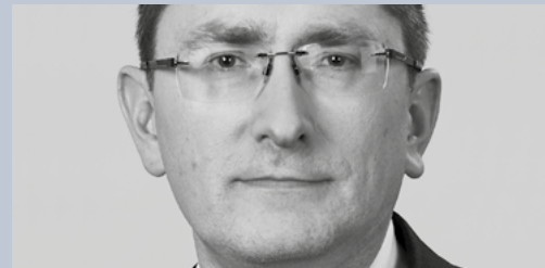
Tālis Linkaits Minister of Transport, Latvia