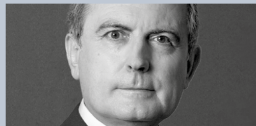
Pedro Saura Secretary of State for Transport, Spain