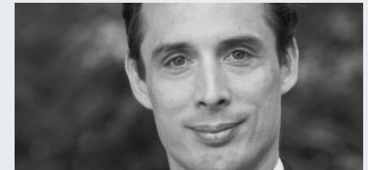
Jean-Baptiste Djebbari Minister of State for Transport, France